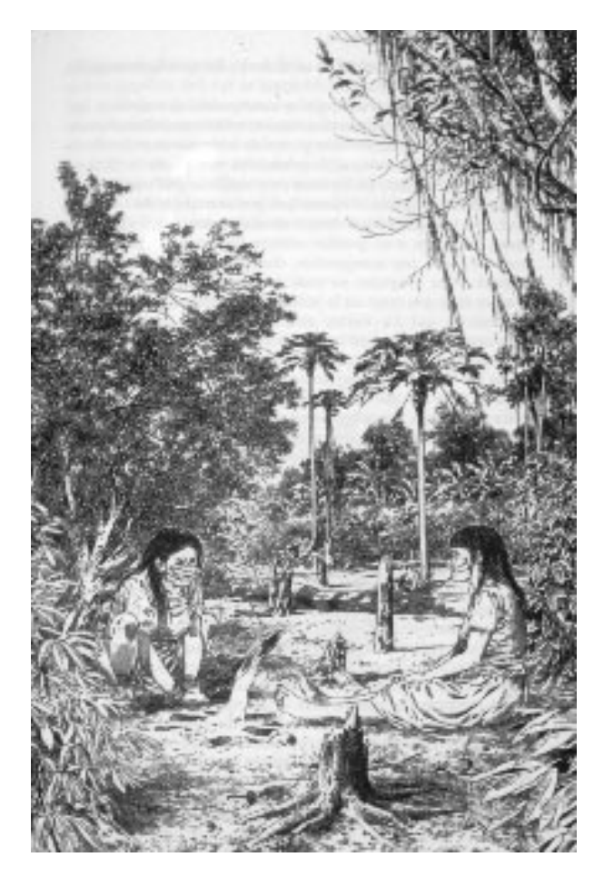
2. Two women in an Achuar garden, drawn by Philippe Munch after a document by Philippe Descola (from Descola, Les lances du crépuscule, 119)

pests and plagues which torment man is very deeply rooted. It has got a significant parallel in the belief that sorcery and sorcery alone is the ultimate cause of all which threatens human health and welfare and produces the accidents to human life. Neither crocodiles nor a falling tree nor death by drowning ever come of themselves, they are always induced by black magic."<sup>29</sup> Thus natives see magic as an activity that fulfills an important purpose; it reduces anxiety in the face of life's hazards, and it restores hope at times of distress. Care lavished upon magical aspects of gardening allows them to expect bountiful crops, and for that reason gives rise to aesthetic appreciation. This is a functionalist interpretation—magic and aesthetic each contributing to the maintenance of social order.