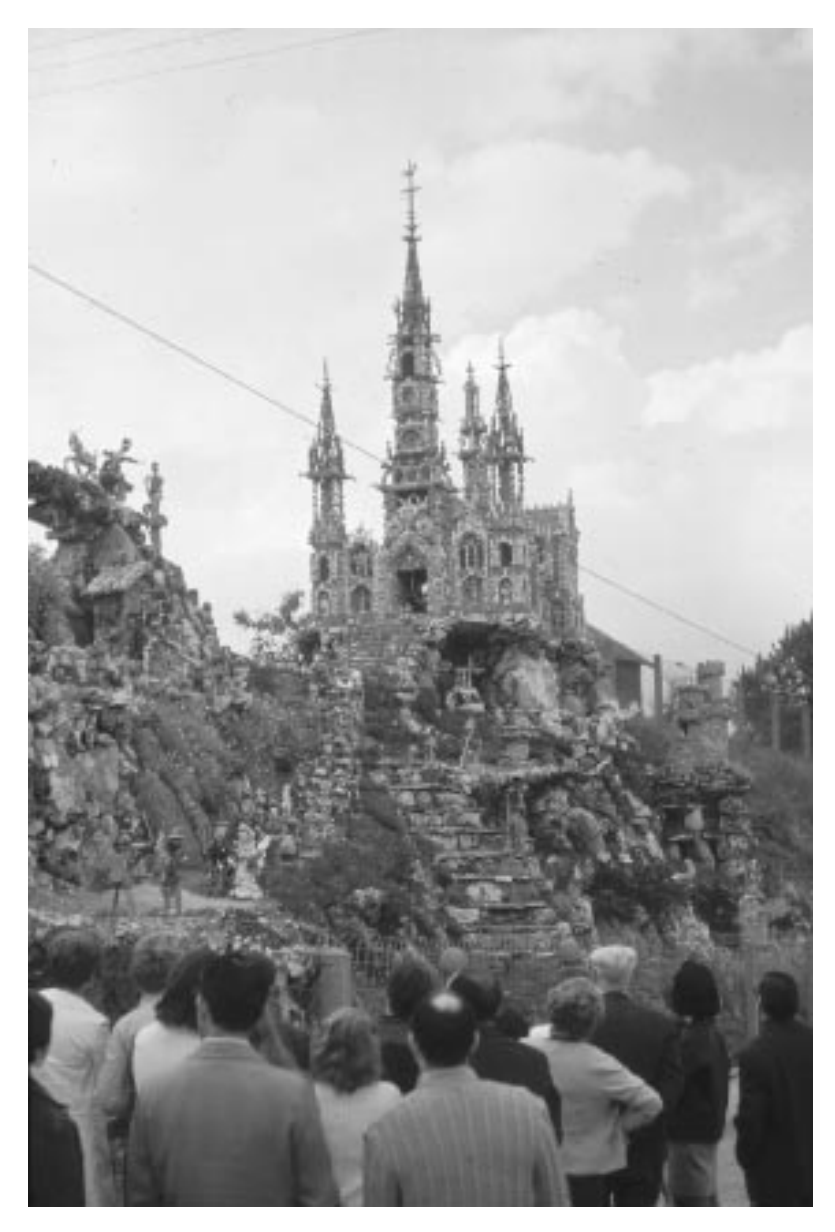
4. Suburban visitors viewing a garden near Nantes in France

In short, gardening by visionaries is a way of asserting individual expression by offering an infinite variety of garden elements. In that sense it stands in opposition to gardening by socially dominated groups. However, it also enables these gardeners to redeem their selfesteem and to reclaim a social identity that their social environment is denying them, and to bring order to their own world. They are very often poor at expressing themselves through articulated speech, a disability many articulate outsiders capitalize on to depreciate